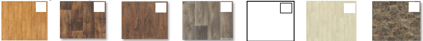
Maple (66) Vineyard Brown (61) Laurel Brown (62) Mountain Grey (63) Snow (89) White Wash (65) Rosemary Stone (64)