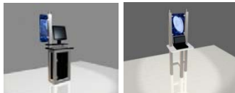
CS1* CS2* CS1 - 3' W x 1' 9" D x 6' 3" H CS2 - 2' 3" W x 1' 6" D x 6' 3" H