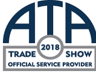
EXHIBIT RENTAL ACCESSORIES

Archery Trade Association January 11 - 13, 2018 Indiana Convention Center, Indianapolis, IN Event Code: 1110370118 Discount Deadline: December 12, 2017