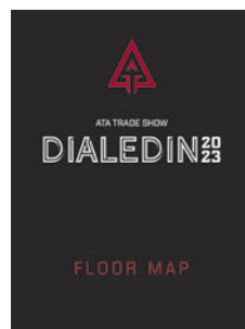
• FRONT •