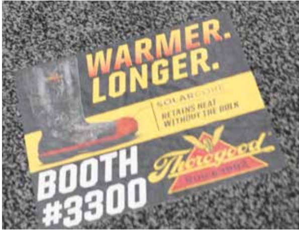
Exhibit Hall Directionals: $6,000/each (2 Sponsorships Available)

This sponsorship will lead attendees right to your booth. Directionals will be placed on the Show floor starting at each of the entrances.